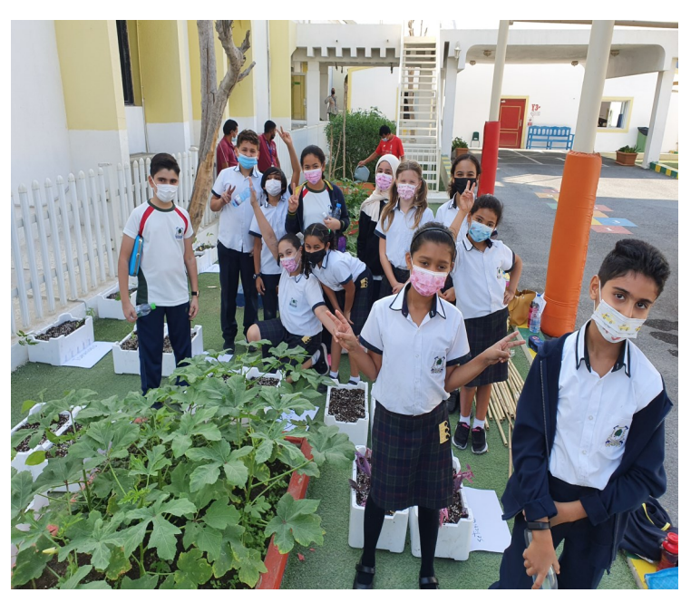
Eco Council celebrating after an afternoon of planting, as part of the Farm Your Country project.