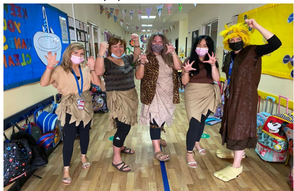
Teachers can have fun too!