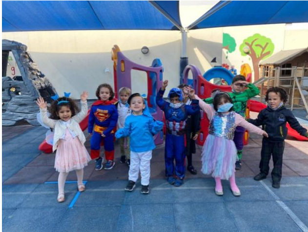
Fun Dress up days!