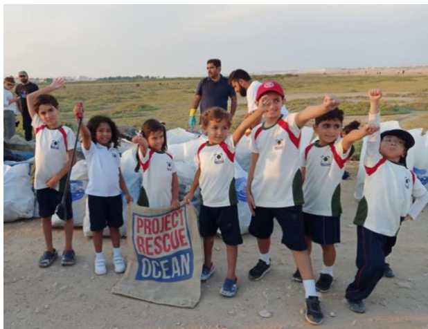
Working together to help charities!